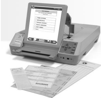
AutoMARK Ballot Marking Machine

Absentee ballots are available in the Election Office through November 7 until 5 p.m. ( not on Election Day ). Ballots may be requested over the phone or in person. If requesting a ballot for someone else, the Election Office must mail the ballot to the voter or you may bring a note signed by the voter stating you may deliver the ballot to them. If you do not have a note, you CANNOT take the ballot. You may take your ballot or vote it in the office.